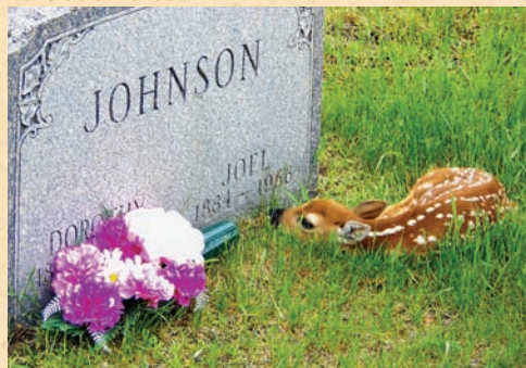
Fawn at Grave Site Donald Buckman—Springbrook, Wis.