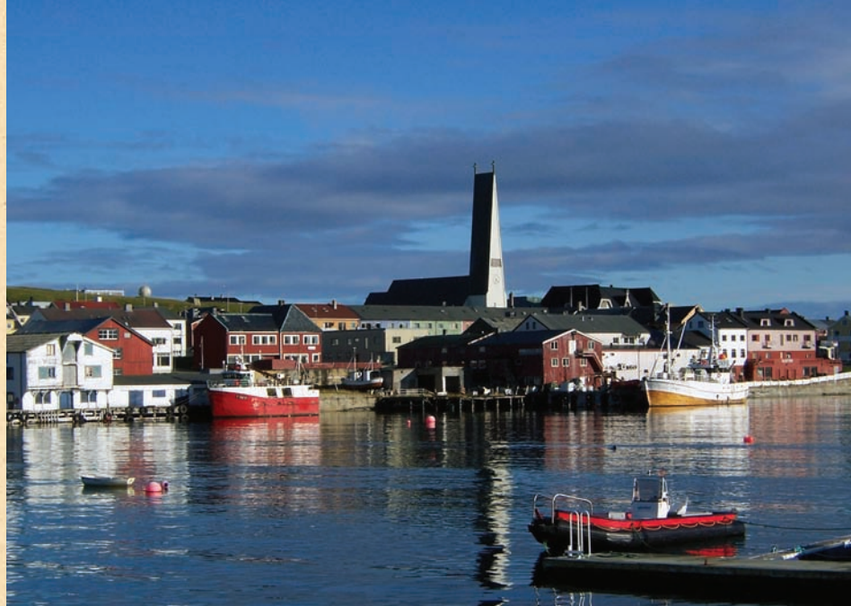
1st Vardo Morning, Coastal Norway Pat Woods—Sun City West, Ariz.