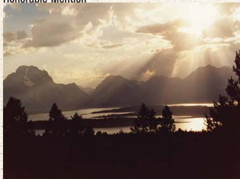
Before the Storm Pat Woods—Sun City, Arizona

Don't miss the 2007 Contest Rules and New Categories on page 19.