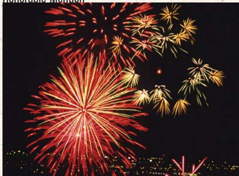
Over the Garden Wall Thomas Kuehn—Tuscon, Arizona