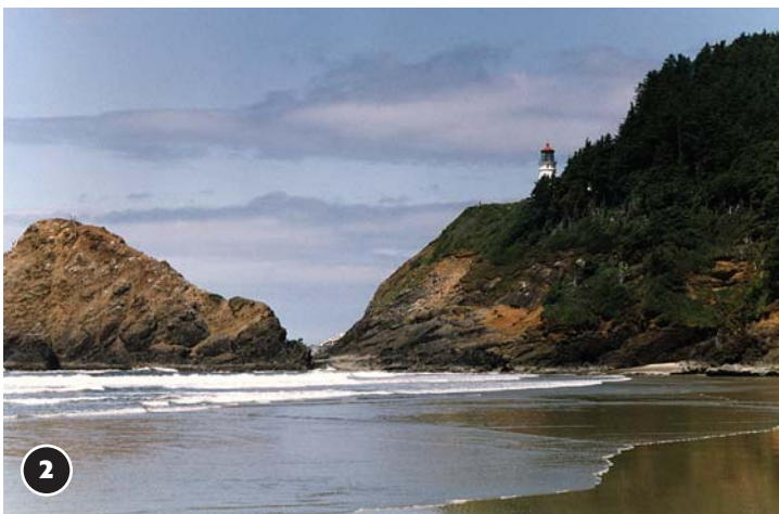
Heceta Lighthouse near Florence, Oregon