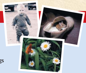
2003 Contest Winners

MAIL ENTRY TO: Fraternal Services National Mutual Benefit P.O. Box 1527 Madison, WI 53701-1527